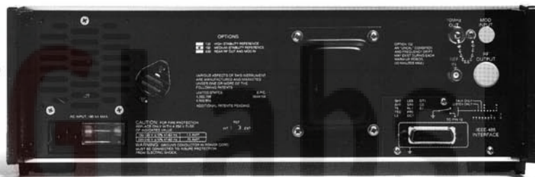
Giga-tronics 6061A and 6062A Rear Panel

PULSE IN (6062A): Present only if option 830 is installed