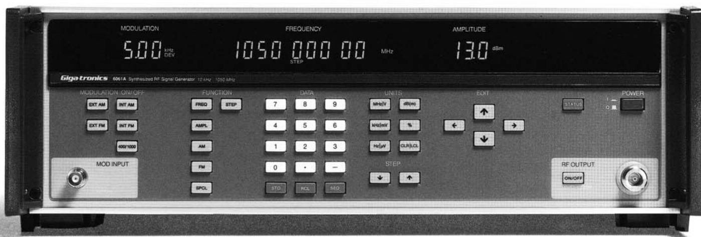
The Giga-tronics 6061A Synthesized RF Signal Generator is an ideal choice for general purpose RF testing.

Built-in AM and FM are provided along with a number of amplitude features, including Relative Amplitude,