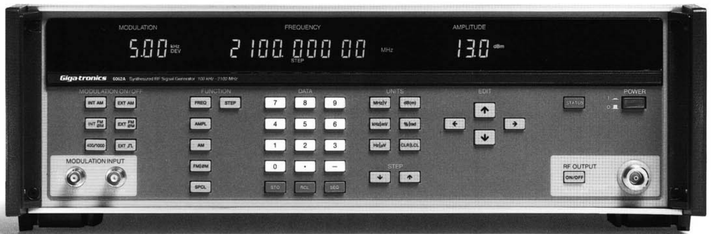
The Giga-tronics 6062A Synthesized RF Signal Generator adds the modulation capability needed to generate complex signals for communications and radar testing.

Contact your local Giga-tronics representative for more information or a demonstration.